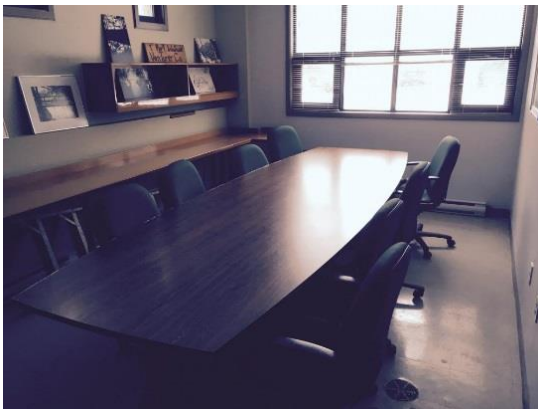
Boardroom Meeting Space

In the fall of 2014 the Commission was given approval to convert office space into a usable board room. This space can accommodate 8-10 around a board room table.