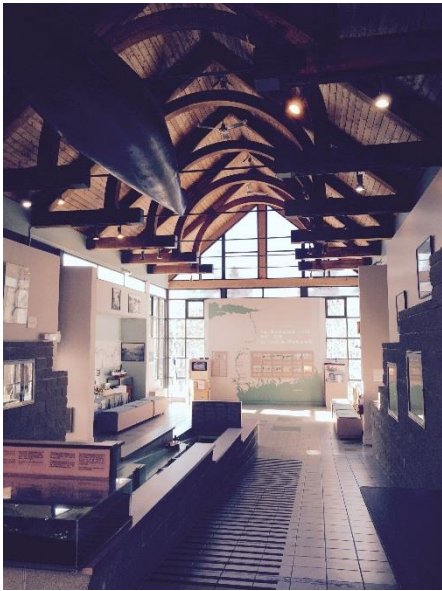
The Fairbanks Centre

The Fairbanks Centre has been host to many looking for interpretation of the Shubenacadie Canal. This museum features a working lock replica that helps to show young and old a glimpse on how watercraft made their way through the canal. This facility is available year-round and can be booked for receptions or other special events. The site is shared with Canal locks 2 and 3, making it one of the most historic settings in Dartmouth.